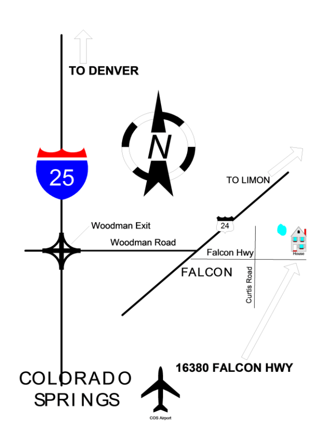
From I-25 North or South: Take Woodmen Road Exit and travel east to Highway 24. Turn Right on Highway 24 and then turn Left on Meridian. Go to stop sign and then Turn Left on Falcon Highway. Turn Left in drive way at 16380 Falcon Highway.